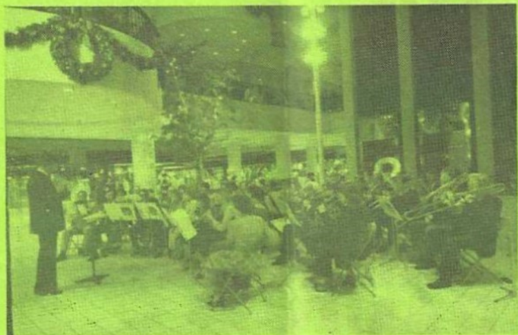
(Christmas Concert at PHS Auditorium)

The Pasadena Municipal Concert Band was formed by a group of citizens who wished to have an organized band and at the same time do something useful for the community. The PMCB rehearses and performs concerts from August through June, taking a break at Christmas and the end of summer.