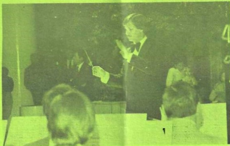
(concert at Gulf Gate Mall)

Members of the Pasadena Municipal Concert Band share the common interest and satisfaction of playing in a group and performing a service for the community. Adults who have previously played a musical instrument now have a performing band in which they can belong.