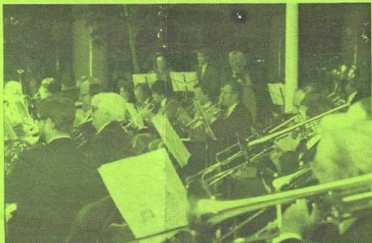
(concert at Almeda Mall — Mickey Mouse Week)

The Pasadena Municipal Concert Band performs at several of the Houston area malls, parks, and other gathering sites; including the annual Strawberry Festival. Concerts are performed every three to four weeks.